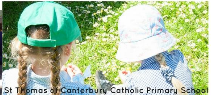
St Thomas of Canterbury Catholic Primary School