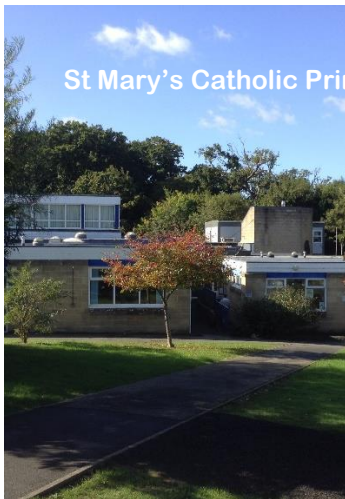
St Mary's Catholic Primary School

The policies of the Governors of the Federation of St Mary's and St Thomas of Canterbury Catholic Primary Schools are intended to ensure that the children rejoice in their dignity as children of God and as a unique creation of God's love. The policies are written so as to support the most effective teaching and learning that we can provide. It is our intention that every aspect of school life will support this fundamental aim.