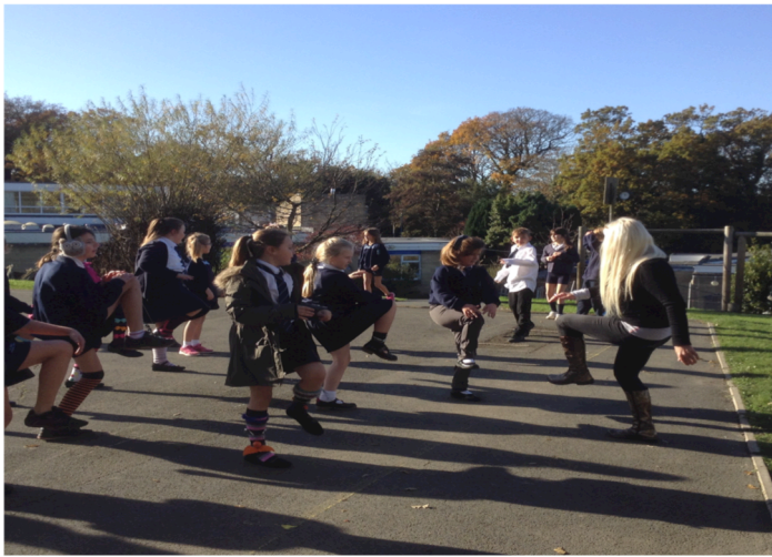
Funky Friday in action at St Mary's

In recent years the DfE have given schools a pot of money specifically allocated to promoting sport and active lifestyles for children. This year saw a significant increase in the Sports Premium received and both schools have been able to: make improvements to their playgrounds, either by improving the surface or the fencing; marking out new court lines for netball and multi-sports; providing PE equipment; and staff training for lunchtime activities.