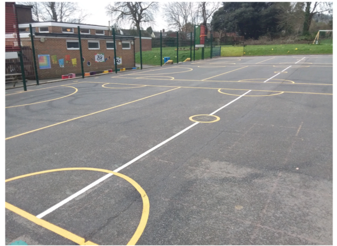
St Thomas' playground markings